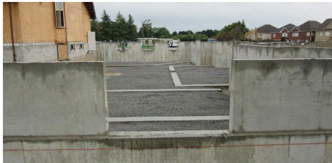
Rock spread in the foundation